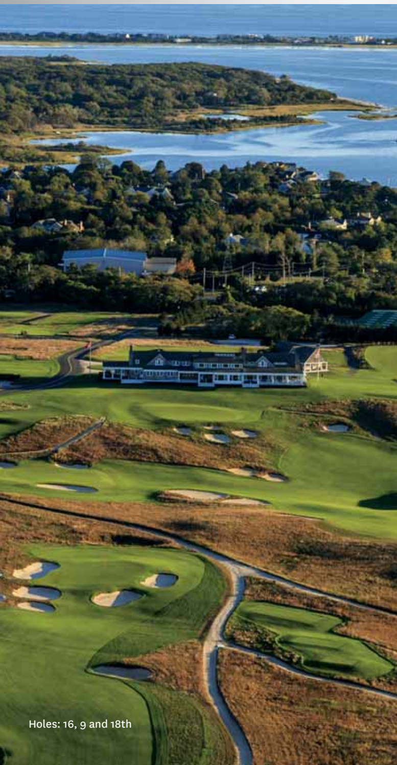
Holes: 16, 9 and 18th