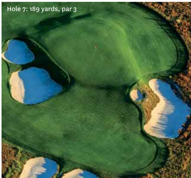
Hole 7: 189 yards, par 3

The USGA has designated an autograph area adjacent to the practice green for juniors ages 18 and under only. Beyond this area, we ask that you respect each player's complete focus on preparing and playing in the U.S. Open and refrain from seeking autographs from the time a player is en route to his first tee until the completion of the player's round. Violation of this policy may result in expulsion and loss of ticket privileges for the remainder of the championship.